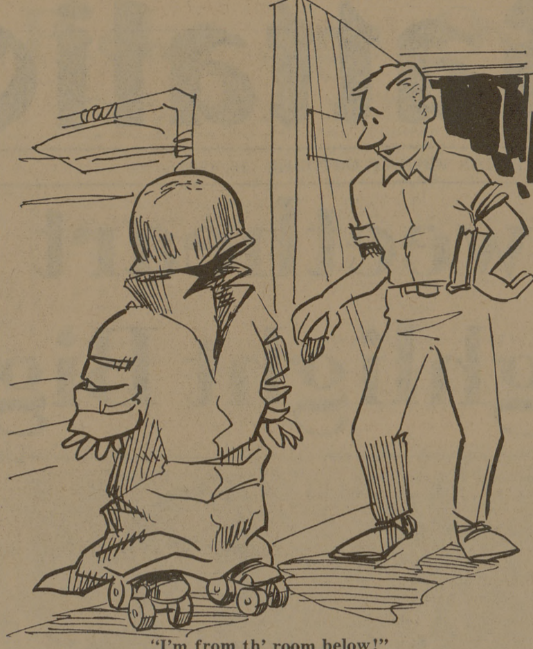
"I'm from th' room below!"