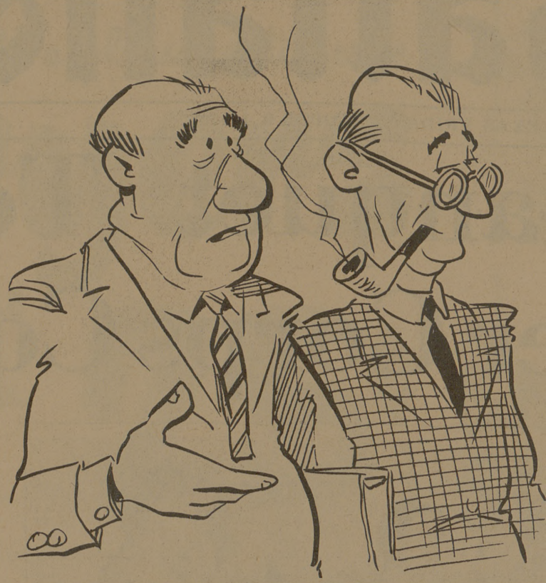
"... They were singing 'California Here We Come' when they left my class—but I didn't attach any significance to it until I walked into that empty classroom today!"