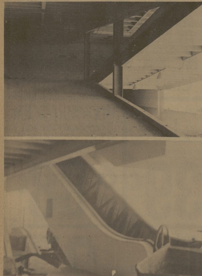
SOME WILL WALK, OTHERS WILL RIDE ... ramps and escalators will whisk spectators to their seats.