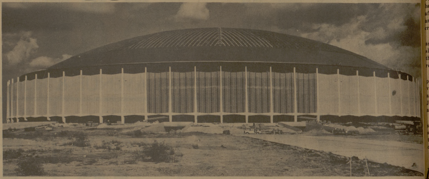
COLT'S HOME IN THE DOME

Gone will be the long climbs to uncomfortable wooden seats.