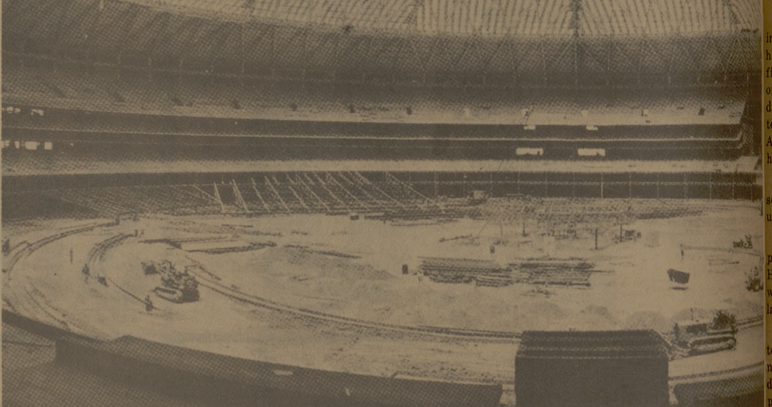
75 PER CENT FINISHED

Every seat in the house will be well worth the money because the roof gives the spectator the effect of being twice as close to the play in action. It is equally hard to believe that the roof is actually 208 feet above the field. Obviously many sports writers have been taken-in by the optical illusion, as is shown by requests for the baseball commissioner's