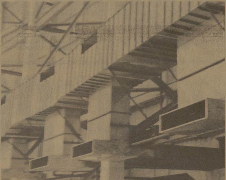
DUCTS RING SPECTATOR AREA ... unit produces 6,000 tons of cooling capacity.