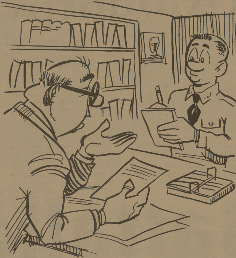
"As your academic advisor and after considering your case, I think I can suggest how you may improve your academic status—you may want to write this down—STUDY!"