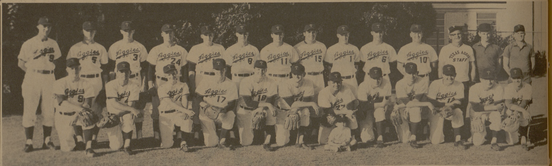
ONLY FOUR BONAFIDE STARTERS RETURNING ... coach finds only three outfielders and one pitcher returning from his '64 SWC championship team.