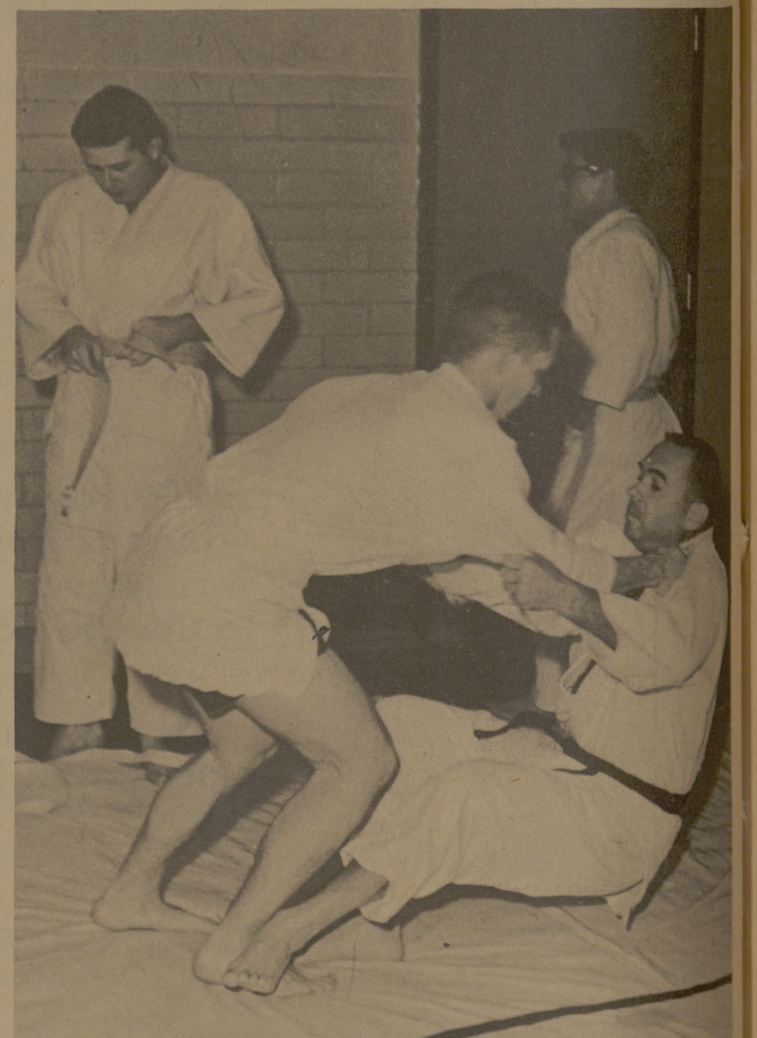
SPORT AND ART OF SELF-DEFENSE ... judo club provides Aggies facility for learning this ancient art.

Although most of the members of these two teams are foreign students, a few Aggies from this country have joined. Members of both clubs say they wish more Americans would come out and enjoy their sports with them.