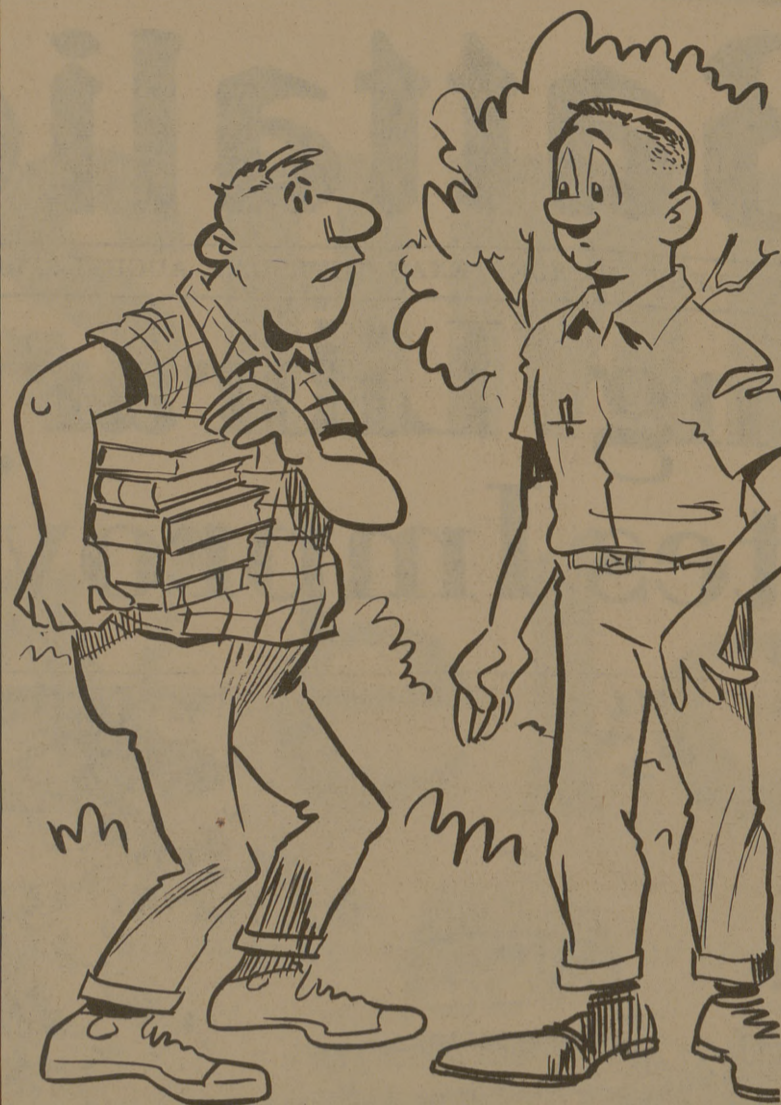
"With th' Viet Nam situation lookin' like it is, I'm goin' bring up my grades—they may draft me!"