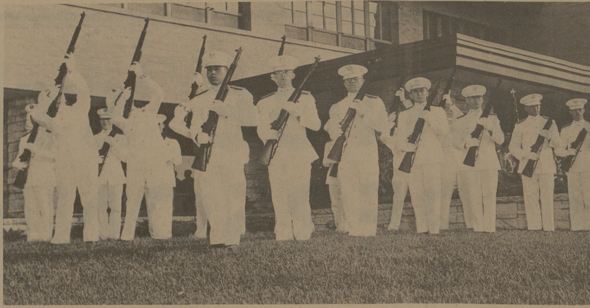
THE ROSS VOLUNTEERS ... elite group of A&M cadets perform all over the country.

ALSO AT THIS time, membership became limited to 133 members at a ratio of two juniors to one senior. This ratio insures a constant flow of candidates for special training and development in the company and for qualified potential leaders of the highest caliber.