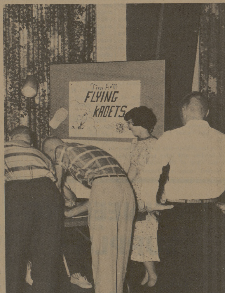
EXTRA CURRICULAR EXHIBITS

Cadet orientation and organization of cadet units in the dormitory area will be the agenda for Saturday.