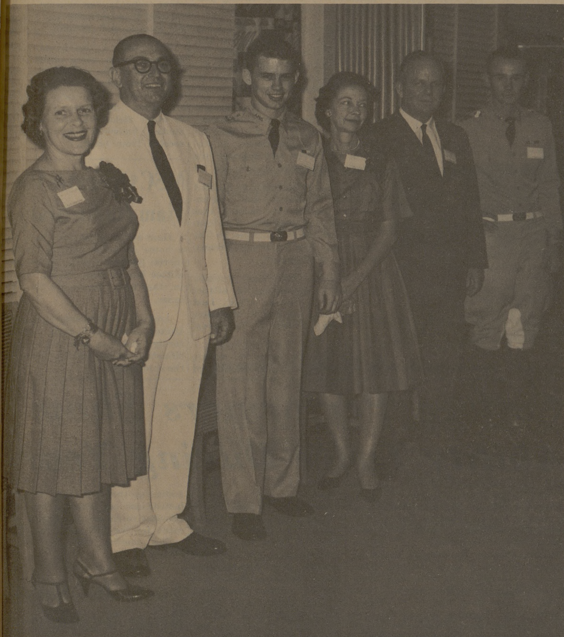
THEY WAIT TO RECEIVE YOU!