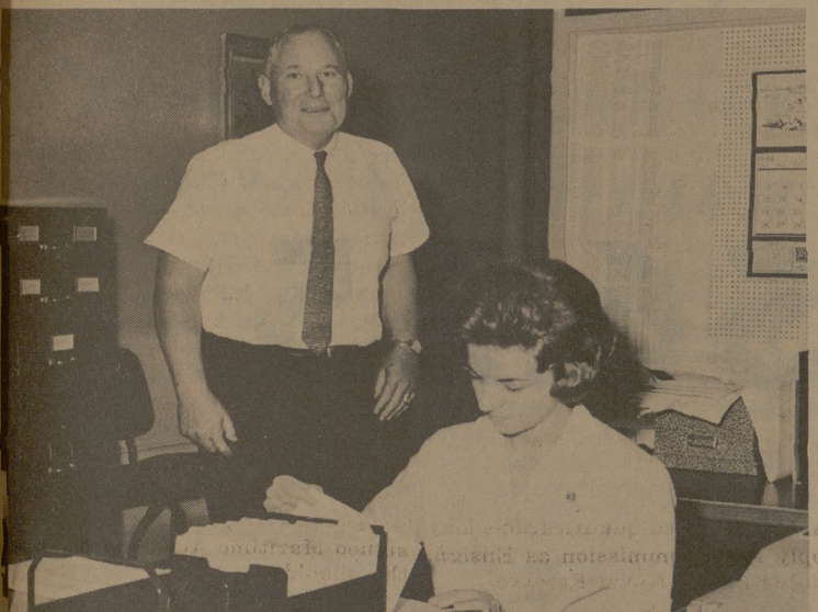
THE FRIENDLY LOAN MAN ... tries to give help where help is needed.

There are $104,520 available in freshmen school scholarships, and $52,425 in upperclassmen awards. Information and applications forms are available from the Director of Student Aid in Room 8 of the YMCA Building.