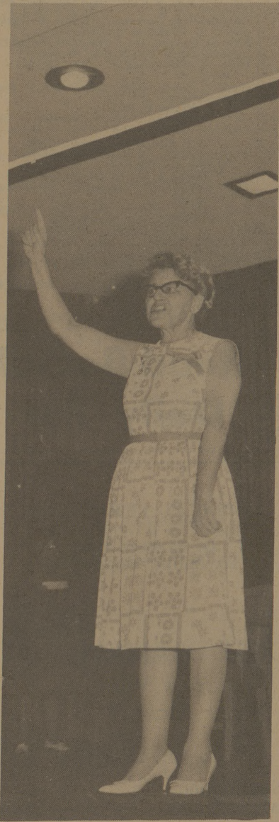
NOW HEAR THIS ... curfew will be enforced!