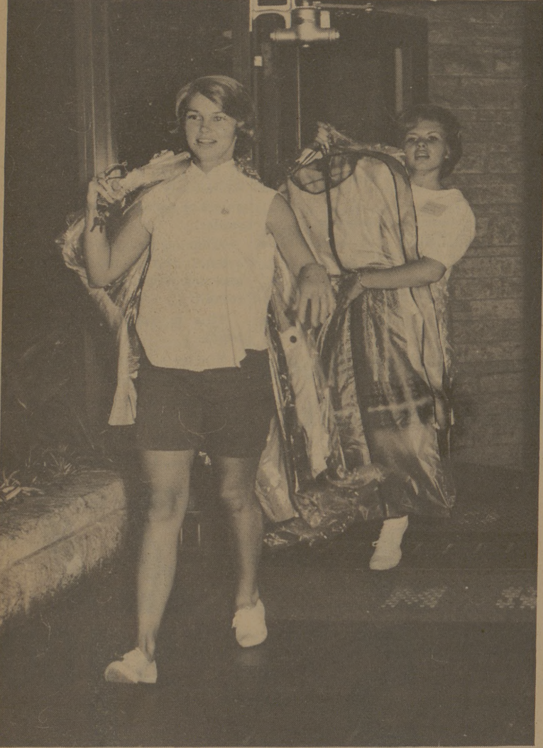
SO THIS IS AGGIELAND ... no hot air here.