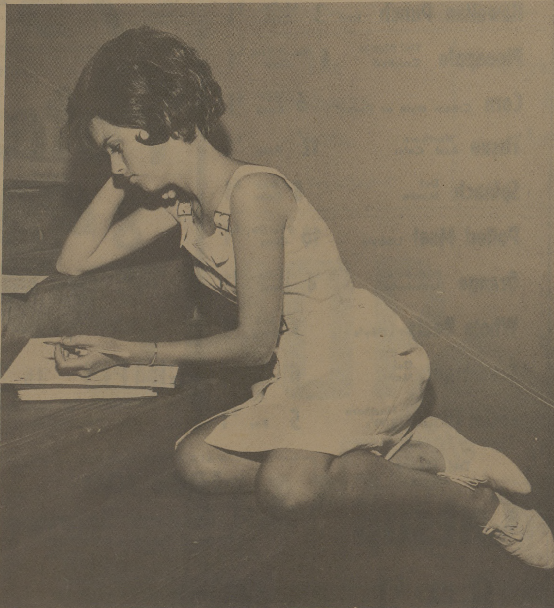
PLENTY OF HOMEWORK TO BE DONE ... after curfew, dances, parties swimming, singing and other small details.