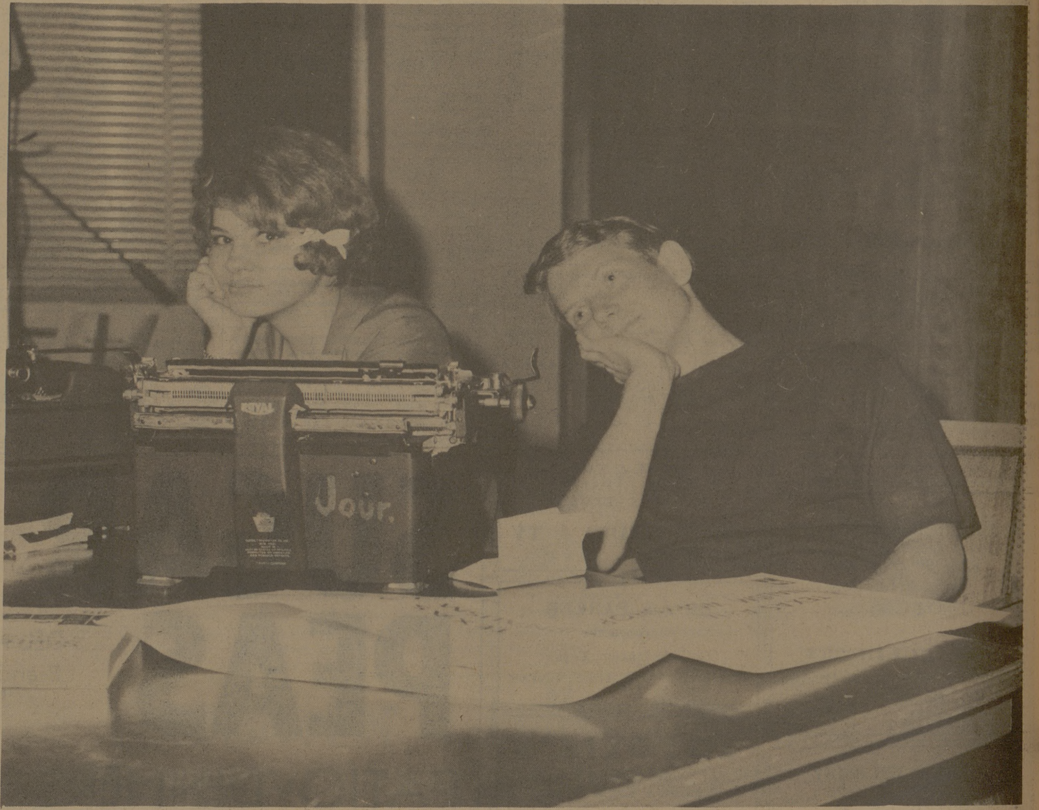
WHO, WHAT, WHEN, WHERE, WHY ... it is too cool here to get out and get any kind of story.