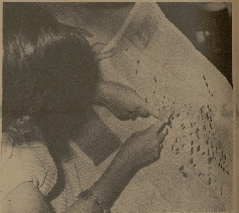
HERE, NO HERE, NO— ... just were on the campus are we?