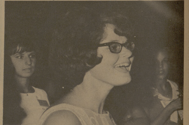
YOU MUST BE JOKING ... a 10:30 curfew for us grown-ups?