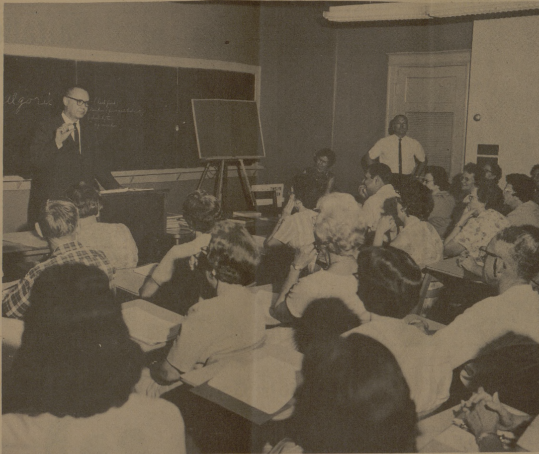
TEACHERS LEARN MATH ... attending two week session on modern math.