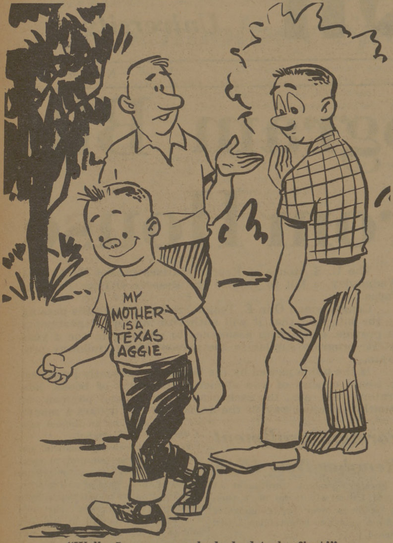
"Well—I guess somebody had to be first!"