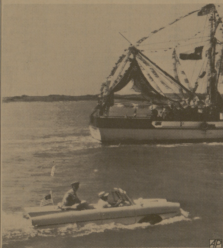
ATTENTION GETTER Splash Day visitors at Galveston had a hard time believing their eyes when this amphibious automobile escorted one of the decorated vessels in the Blessings of the Shrimp Fleet in Galveston Harbor.