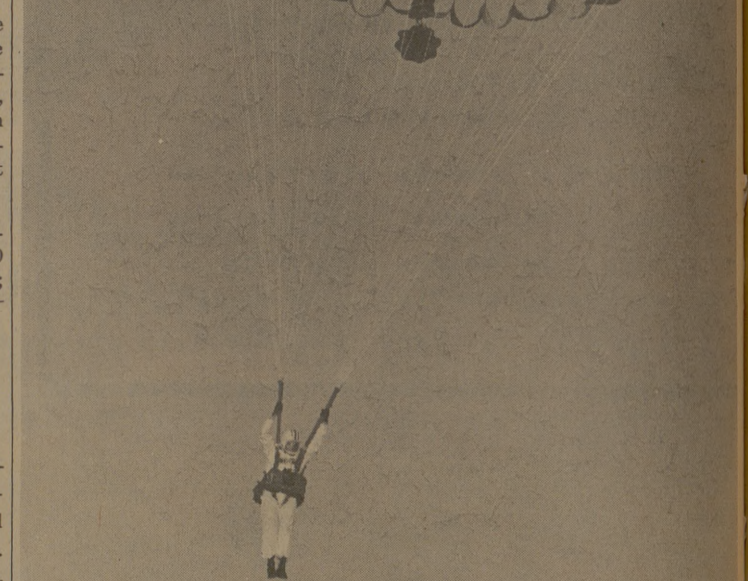
SKYDIVER OLDEN PREPARES FOR LANDING Pat Works of A&M is descending in background behind Olden's canopy.

Skydiving competition will be comprised of five events: novice accuracy with two jumps from 3,000 feet; intermediate accuracy, two jumps from 3,800 feet with 10 seconds delayed fall; senior accuracy, one jump from 5,500 feet with 20 second delayed fall. Also team baton pass and accuracy, three-man team from 7,200 feet with 30 second delayed fall;