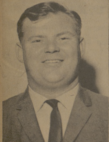
WRIGHT Summer Battalion