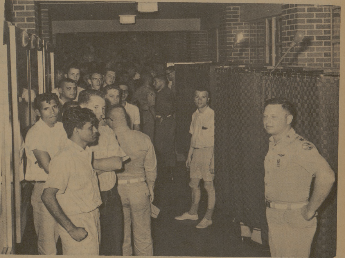
TYPICAL THURSDAY VOTING SCENE Students patiently wait their turn at the voting booths.