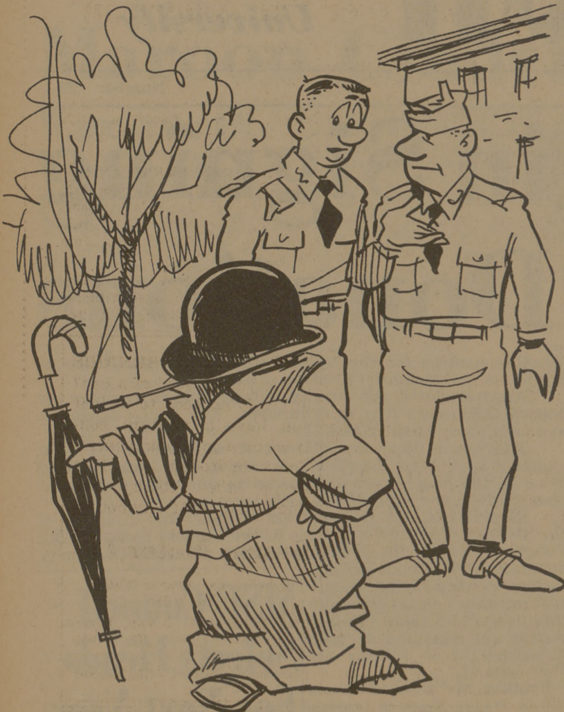
"He's changed considerably since that cricket match!"

General anesthesia implies insensibility to pain with total loss of consciousness.