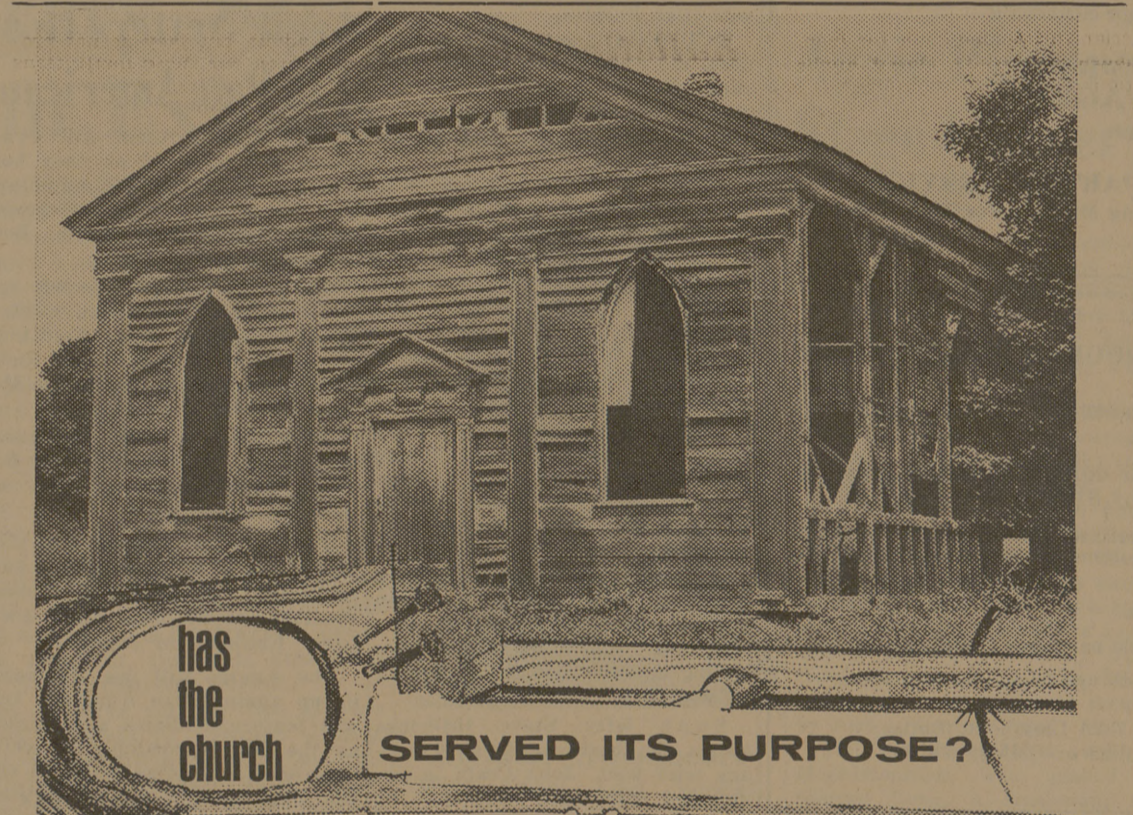
has the church SERVED ITS PURPOSE?

FAITH CHURCH UNITED CHURCH OF CHRIST 9:15 A.M.—Sunday School 10:30 A.M.—Morning Worship 7:30 P.M.—Evening Service COLLEGE HEIGHTS ASSEMBLY OF GOD 9:45 A.M.—Sunday School 11:00 A.M.—Morning Worship 6:30 P.M.—Young People's Service 7:30 P.M.—Evening Worship A&M METHODIST 9:45 A.M.—Sunday School 10:55 A.M.—Morning Worship 5:30 & 6:00 P.M.—MYF Meetings 7:00 P.M.—Evening Worship UNITARIAN FELLOWSHIP 10:00—Sunday School YMCA Bldg. 8:00 P.M.—First four Sundays of each month Fellowship Meeting. Hillier Foundation Bldg. CHURCH OF JESUS CHRIST OF LATTER DAY SAINTS 26th East and Coulter, Bryan 8:30 A.M.—Priesthood meeting 10:00 A.M.—Sunday School 6:30 P.M.—Sacrament Meeting