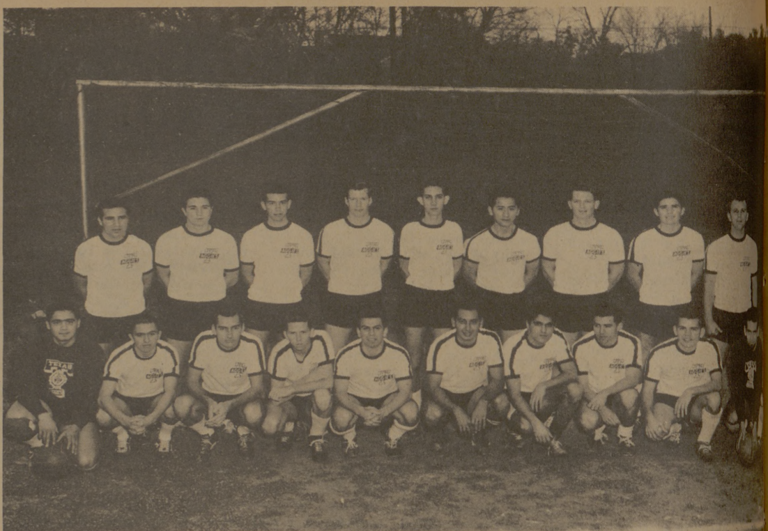
Aggie Soccer Team

Our Aggie Team is made up of players from many countries, in-