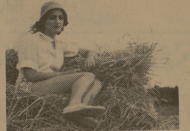
Everybody enjoys farm work in Europe