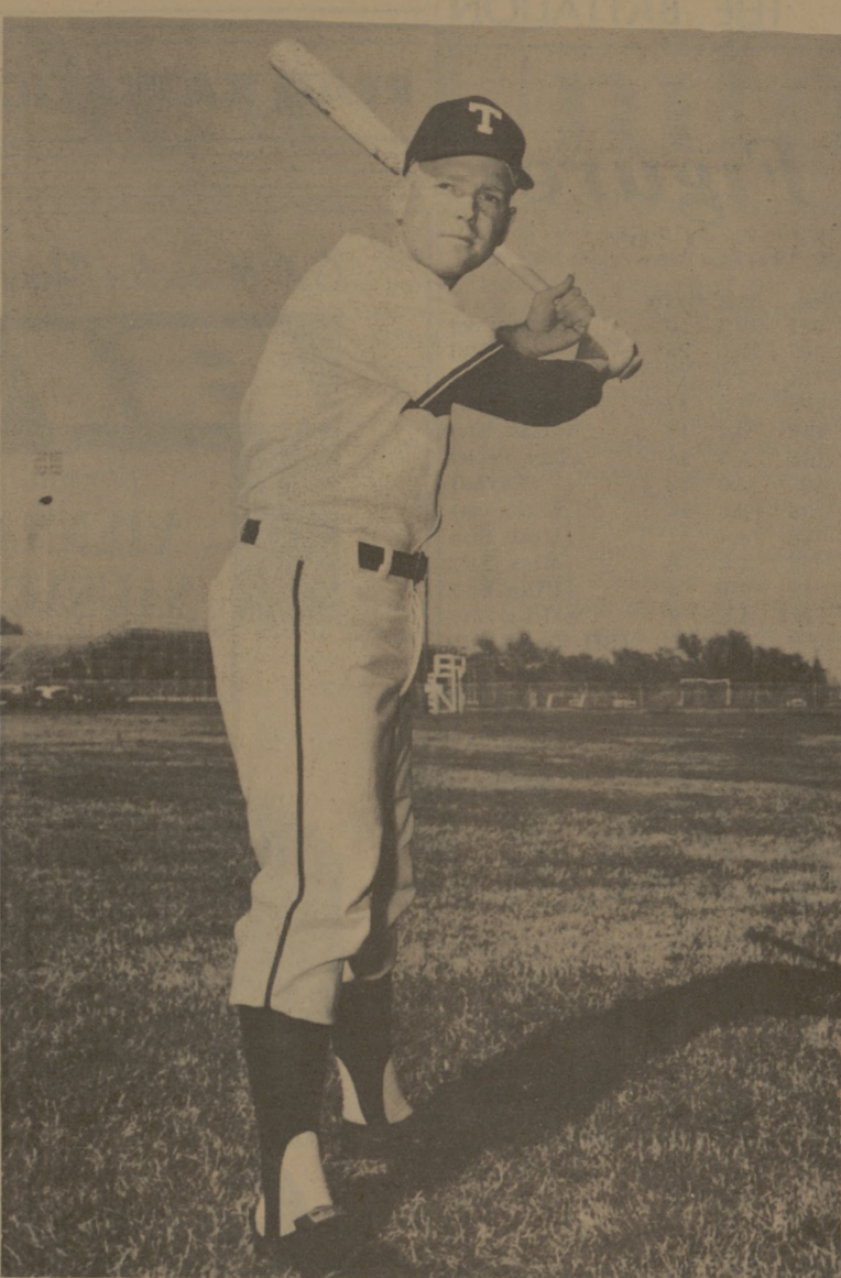
Filling New Position

SAN ANTONIO, Tex. (AP)—Las Vegas, Nev. has become the fifth member of the recently-organized North American Football League, which will begin play in September if a sixth club can be located as late as June 15.