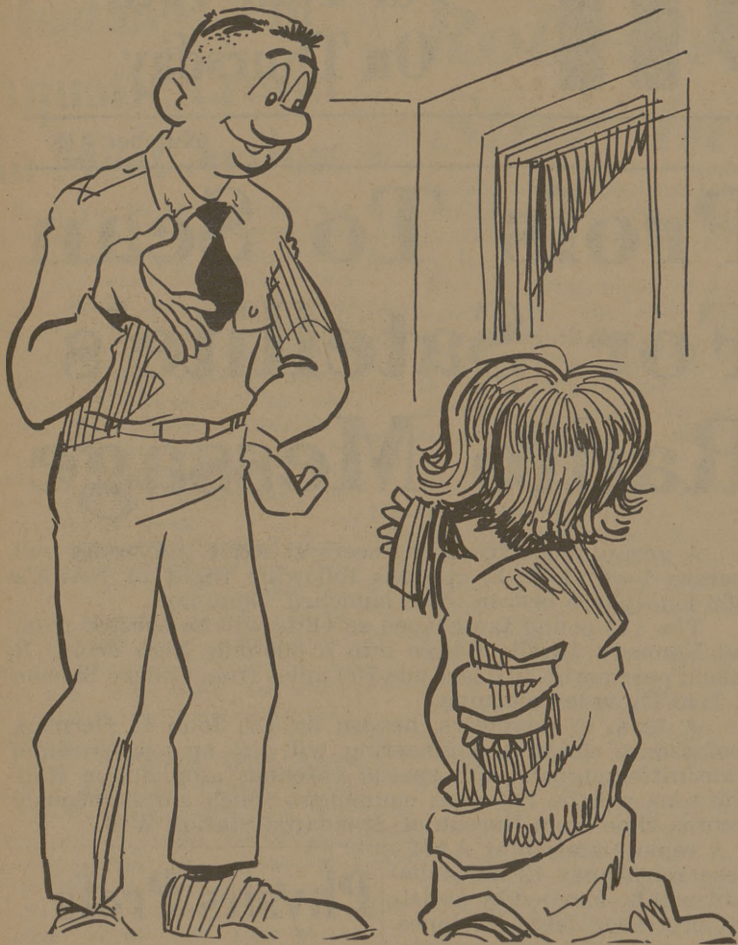
"You're right! With your beetle wig no one will notice that you haven't shaved—but how will it go over with the R.O.T.C. crowd?"