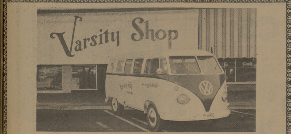
Courtesy Transportation To Townshire

QUANTITY RIGHTS RESERVED Best in Bryan ORR'S Super Markets 2 CONVENIENT LOCATIONS Downtown 200 E 24 Street Ridgecrest 3516 Texas Ave