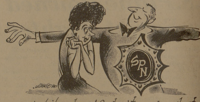
cut it out and paste it on your chest

I am frankly hard put to think of any reason why you should join Signa Phi Nothing. Some people, of course, are joiners by nature; if you are one such, I am bound to tell you there are any number of better organizations for you to join—the Cosa Nostra, for example, or the Society for the Placing of Water Troughs in Front of Equestrian Statues.