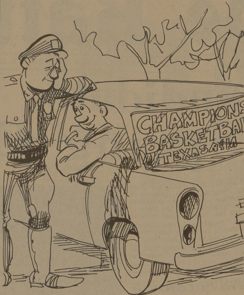
"You've been following me for several miles? Can't figure why I didn't see you!"