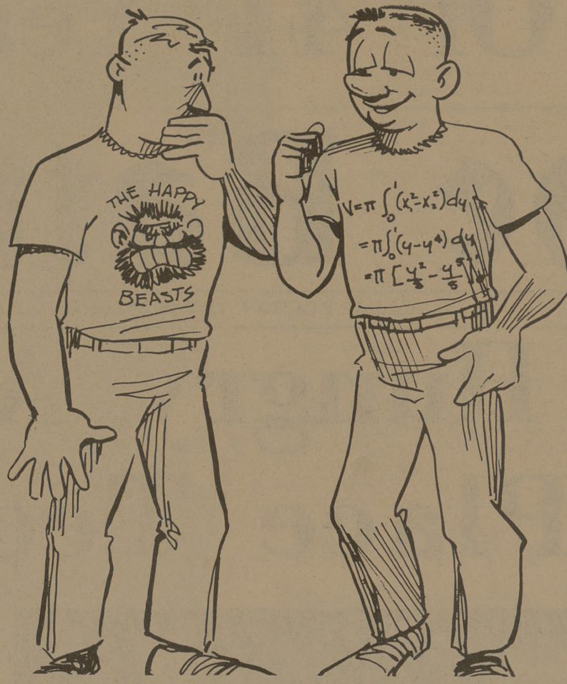
"Our outfit's stressin' academics!"