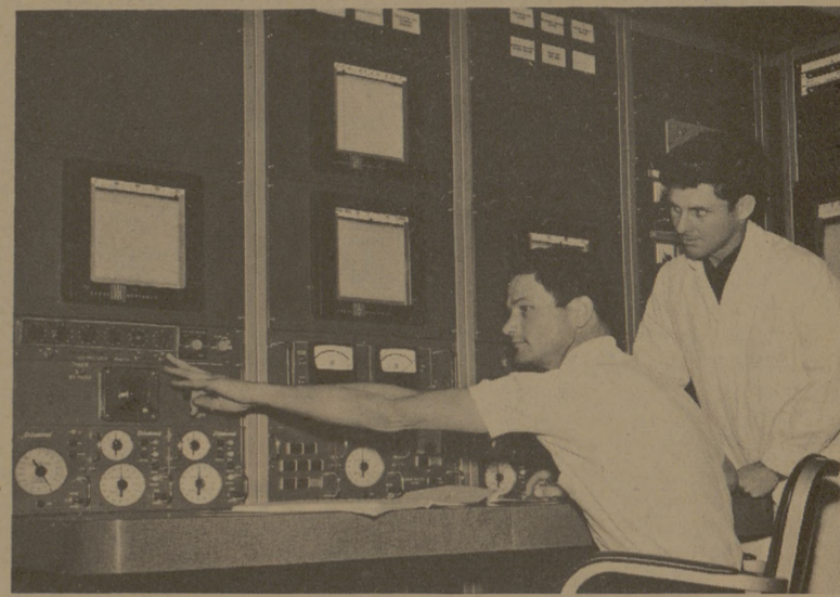
REACTOR OPERATION INSTRUCTOR Marine engineer learns complicated techniques

North Viet Nam and South Viet Name each is roughly the size of the state of Georgia.