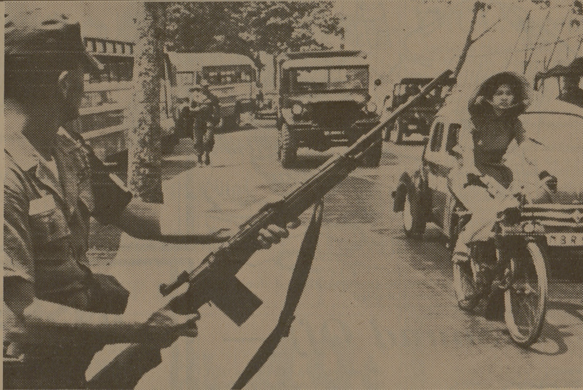
On Guard In Saigon

Visitors to Easterwood Airport Monday will see some low level flying. The flying will be demonstrations of the latest agricultural airplanes and chemical, fertilizer and seed application equipment.