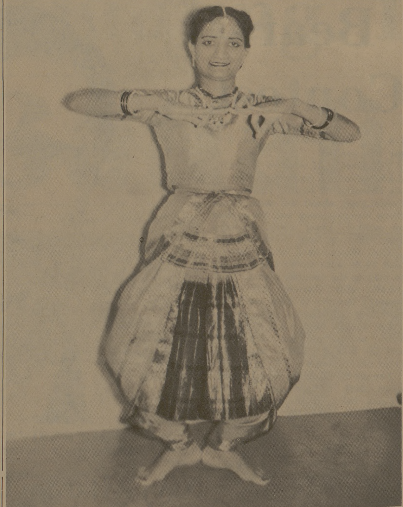
Dancing Indian Style