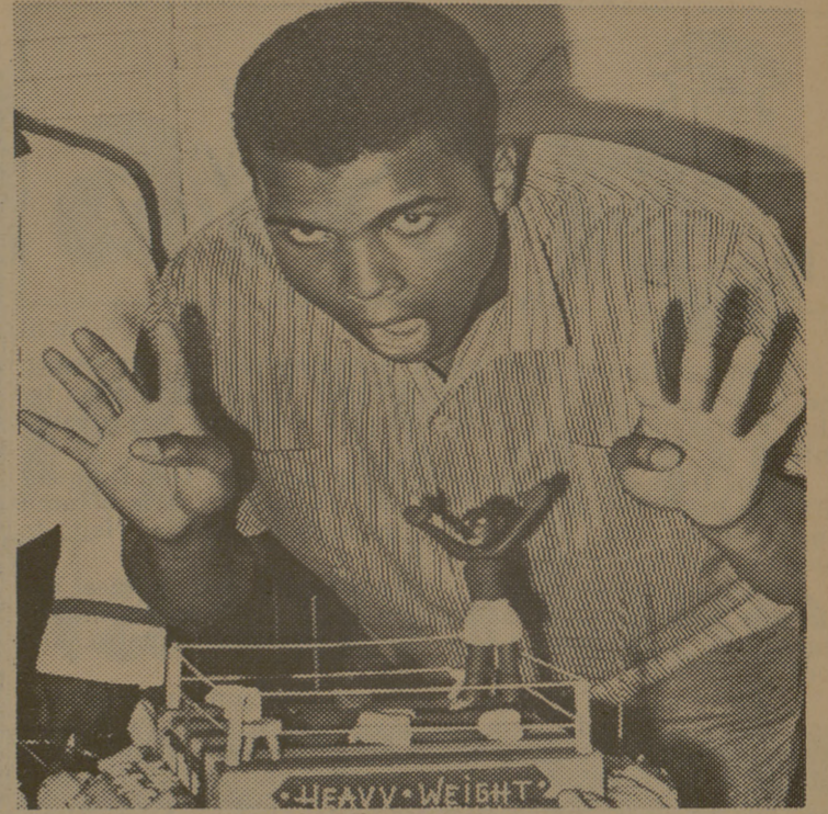
Round 8 For Heavyweight Cassius Clay celebrates his 22nd birthday by predicting the round Sonny Liston will fall in on Feb. 25.

Bowlwise the showing was very good with Texas beating Navy in the Cotton and Baylor strapping Louisiana State in the Bluebonnet. Southern Methodist lost a squeaker to Oregon in the Sun Bowl.