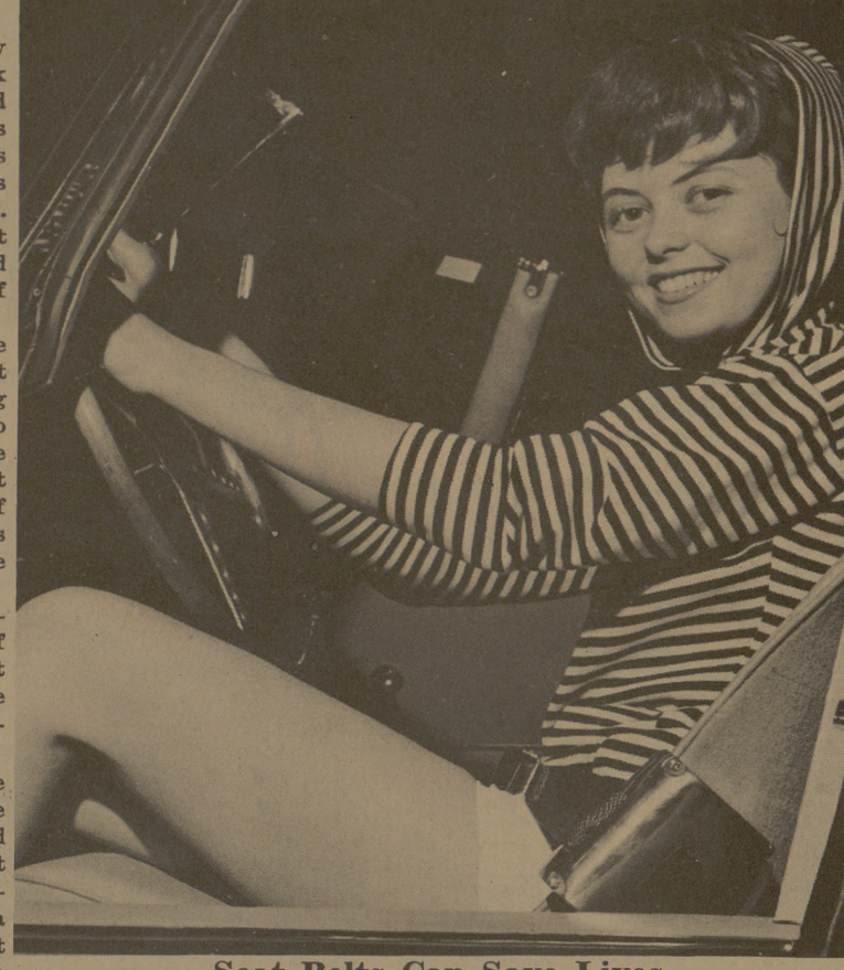
Seat Belts Can Save Lives The National Safety Council says that one third of all serious injury in automobile accidents could be prevented if only the victims had installed and used seat belts. This pretty lass is taking no chances.

"Most people wouldn't allow themselves to be placed in a black box with a one-foot peephole and then be propelled along at speeds of 60-70 miles per hour," Charles J. Keese, director of the Texas Transportation Institute said. "Yet, people do this when they get into their car on a cold day and just scrape away a handful of ice or snow." Keese further stated that while there is little snow here, most Aggies will encounter some during the holidays. "Drivers tend to adjust to bad weather," Keese said, "but only after the first 50 miles. It's at the outset of bad weather that most accidents occur which have as their cause adverse weather conditions." In a 1962 survey of 10,000 accidents occurring over 54 miles of freeways, the institute found that of all the reasons causing the mishaps sight-distance relationship was the greatest cause. "A driver should not overdrive his visibility," said Keese. "He should keep in mind how far and how much he can see and adjust his speed and reactions accordingly. This is the main thing a driver should remember. I can't repeat this statement enough. The failure of a driver to stay within his range of visibility is one of the biggest problems drivers are faced with."