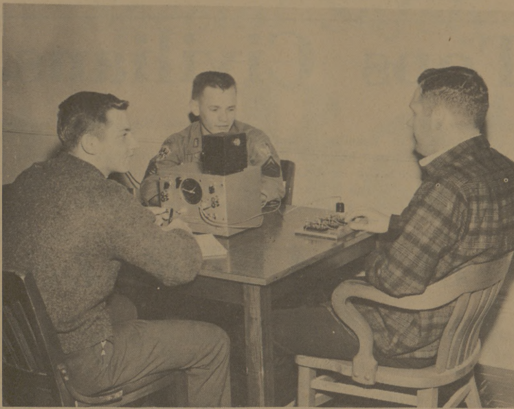
PSYCHOLOGY MAJORS EXPERIMENT Department will graduate 8 in May.

The faculty members hold degrees from universities in several states and collectively have a wide range of professional experience. They also are taking advantage of the increased research facilities at A&M.