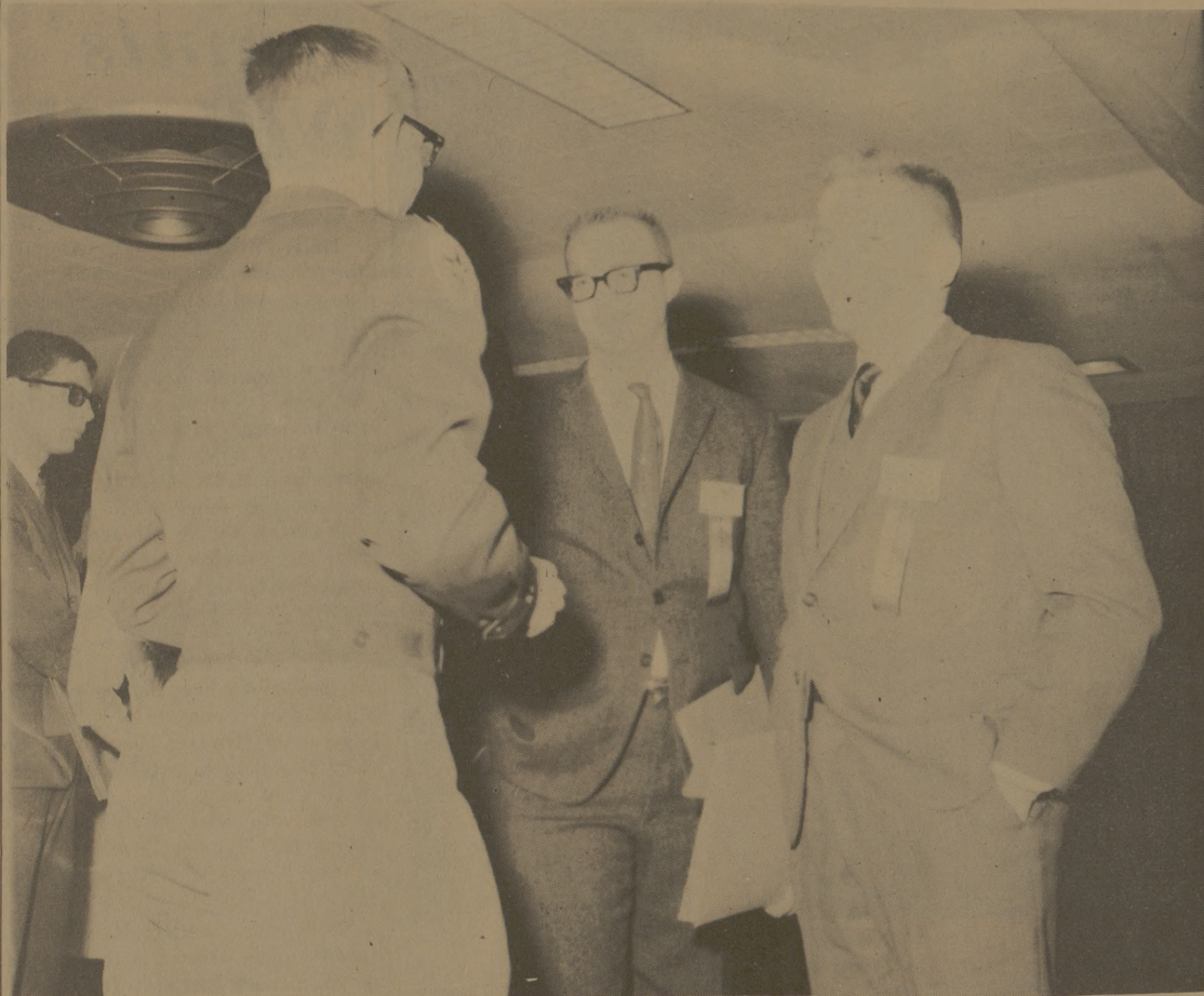
BRIEF CHAT BETWEEN SCONA SESSIONS