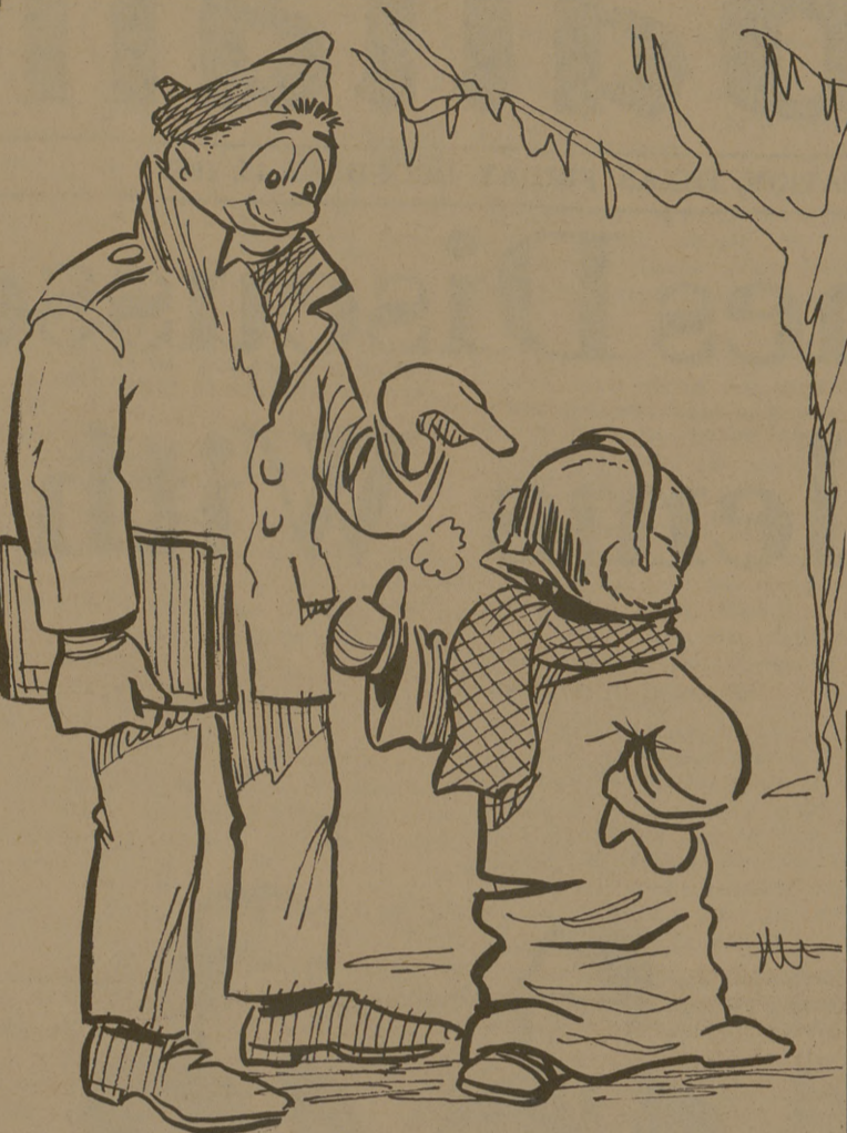
"Because my ears are cold! — Why else would I wear them?"