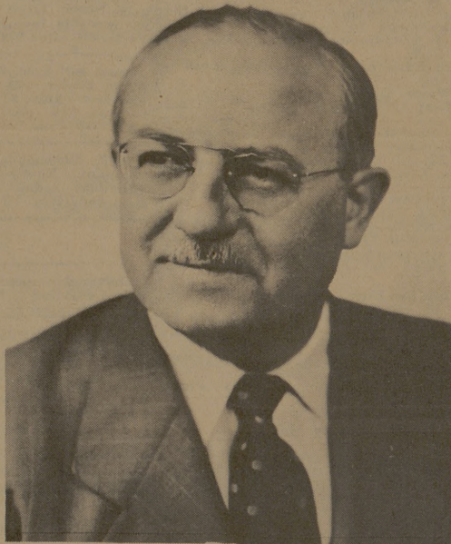
Wednesday, December 11, 8 p.m.