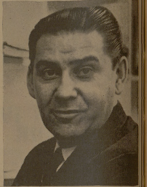
Saturday, December 14, 1 p.m.