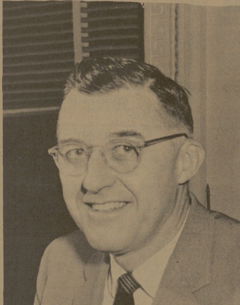
Thursday, December 12, 8 p.m.