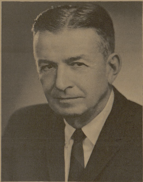
Wednesday, December 11, 2 p.m.