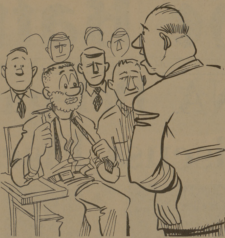
"Maybe some of us should wake up a little sooner!"