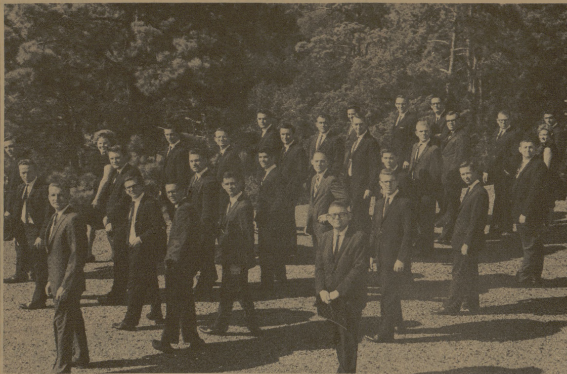
SAM HOUSTON STATE'S BRASS CHOIR Group will perform on campus Monday evening.

Cadets receive their flight training at Easterwood Field the university airport.