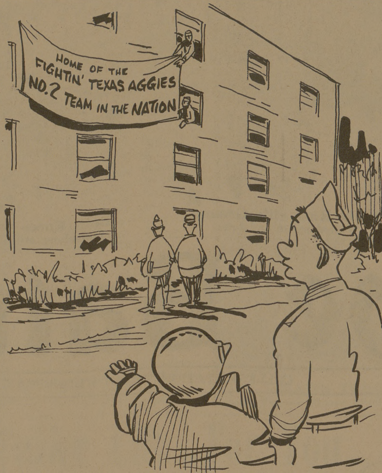
... IF th' sips are No. 1, we're bound to be No. 2!

MOSCOW (AP) — Soviet Premier Nikita Khrushchev declared Tuesday night the Soviet Union will match President Johnson's pledges to work for a more secure world peace.