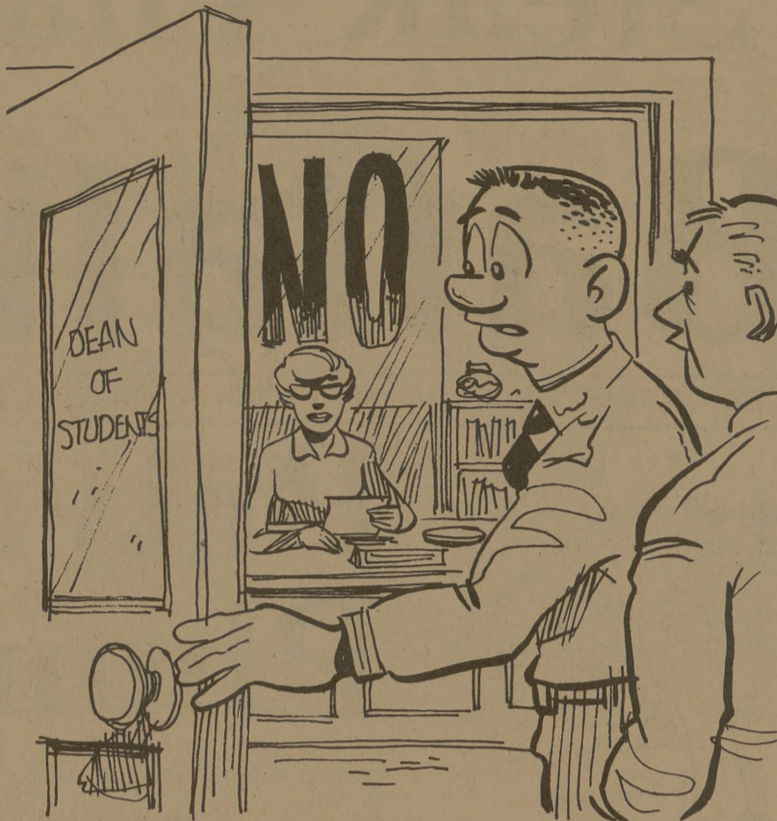
"... Something tells me we're not going to get excuses to leave early for Thanksgiving."