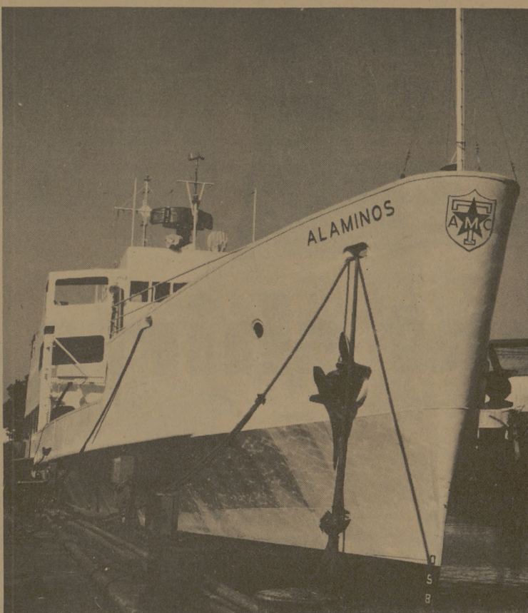
Alaminos Readies For Sea The $3000,000 research vessel is prepared for sea trails at the Levings-ton Shipyards, Orange. She is the largest and best equipped research vessel operated by A&M.

Passive anti-rolling tanks have been installed to reduce the roll of the vessel in heavy seas. This will permit use of instruments in the laboratories under a wider range of sea conditions and will improve living conditions aboard ship.