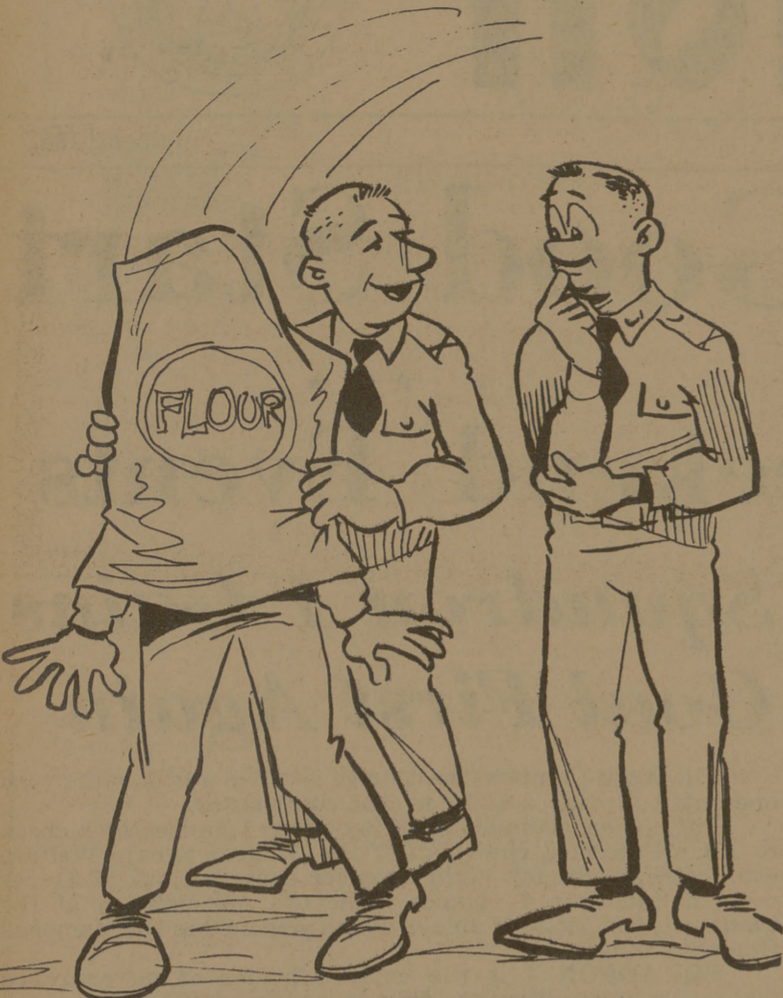
"... See, if we all take sacks to yell practice and th' guy next to us gets rowdy—wham!"