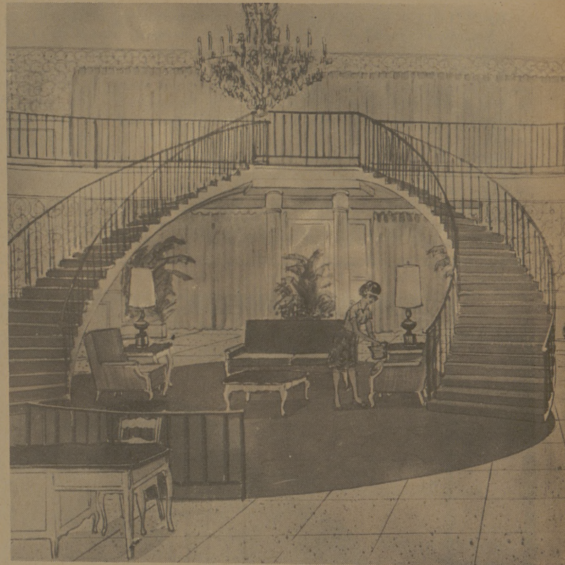
INTERIOR OF RAMADA INN Lobby as envisaged by architect.

The new Ramada Inn will cater to the family, indicated the owners. In the large center portion or court area will be a play area for children and a swimming pool with underwater music. There will be executive suites and a bridal suite for the newlyweds. Also there will be a barber shop, beauty shop, flower shop and gift shop. Office space is available for local businessmen.