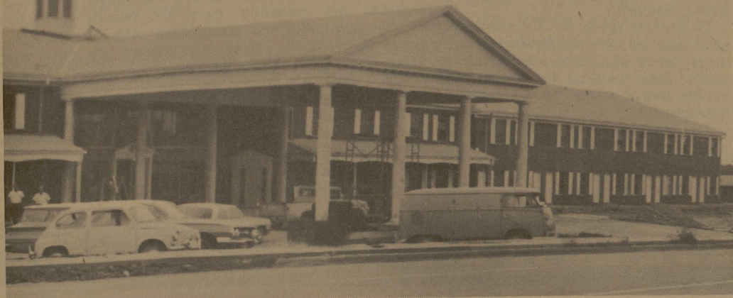
RAMADA INN ALMOST COMPLETE Only finishing touches remain to be done.

BY RAY HARRIS Battalion Special Writer "Going for broke!"