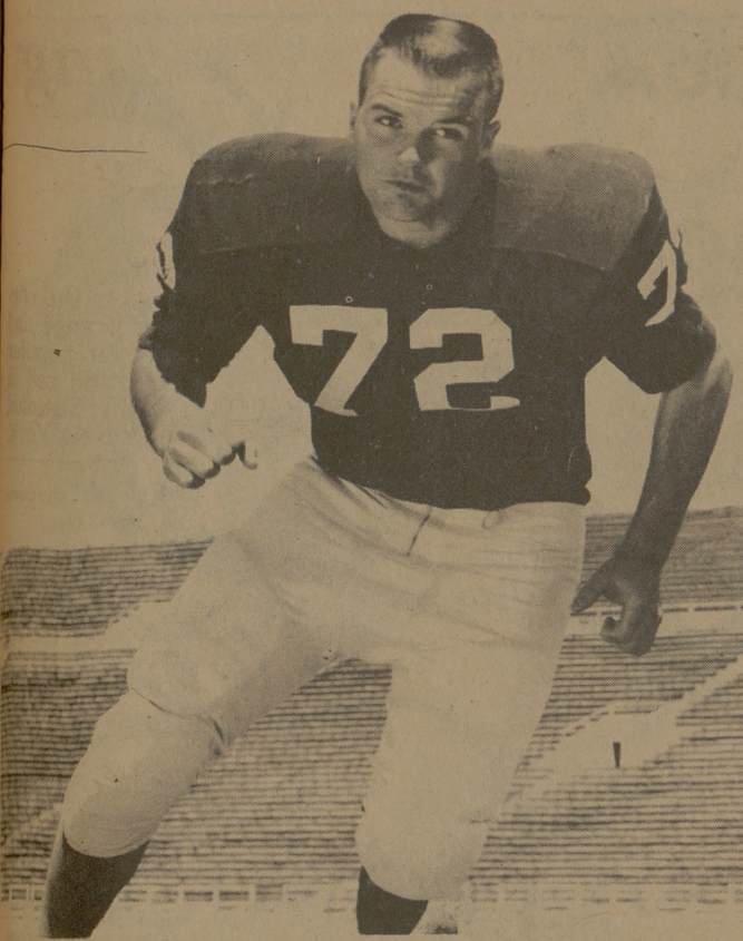
Horned Frog Terror