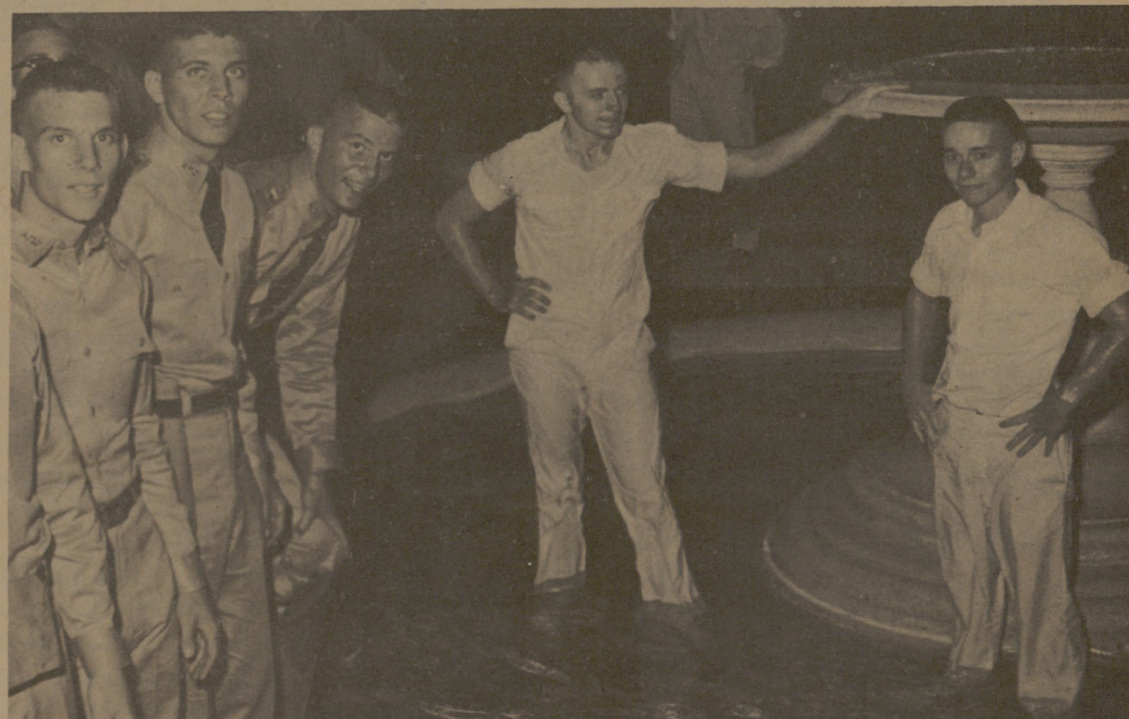
Man, This Is Just The Beginning A old tradition comes alive for the first time as freshmen give yell leadership to the University of Houston Game.