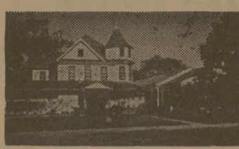
Hillier Funeral Home BRYAN, TEXAS 502 West 26th St. PHONE TA 2-1572