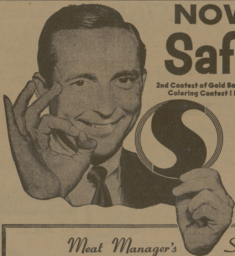
2nd Contest of Gold Bond Coloring Contest!!

October 7-8 Maroon Band (PLEASE NOTE: The studio will have NO BAND BRASS. Band members are requested to bring OWN BLOUSE & BRASS) October 8-9 White Band 9-10 Squadrons 1-3 10-11 Squadrons 4-6 14-15 Squadrons 7-9 15-16 Squadrons 10-12 16-17 Squadrons 13-14 17-18 Squadrons 15-17