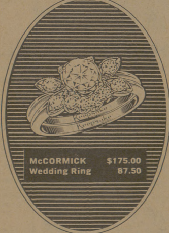
McCORMICK $175.00 Wedding Ring 87.50

Authorized Keepsake Jewelers may be listed in the Yellow Pages. Visit one in your area and choose from many beautiful styles, each with the name "Keepsake" in the ring and on the tag.