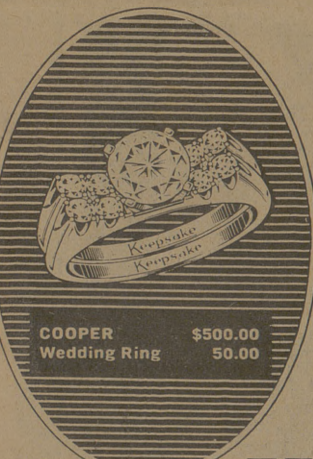
COOPER $500.00 Wedding Ring 50.00