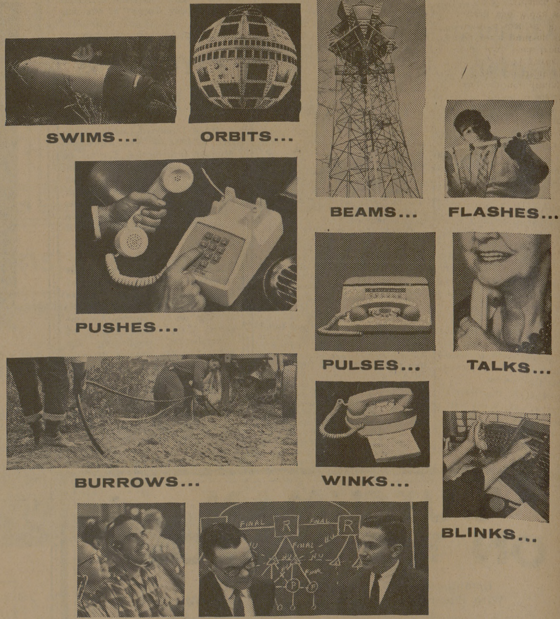
AND LIVES AND BREATHES...

Progress takes many shapes in the Bell System. And among the shapers are young men, not unlike yourself, impatient to make things happen for their companies and themselves. There are few places where such restlessness is more welcomed or rewarded than in the fast-growing phone business.