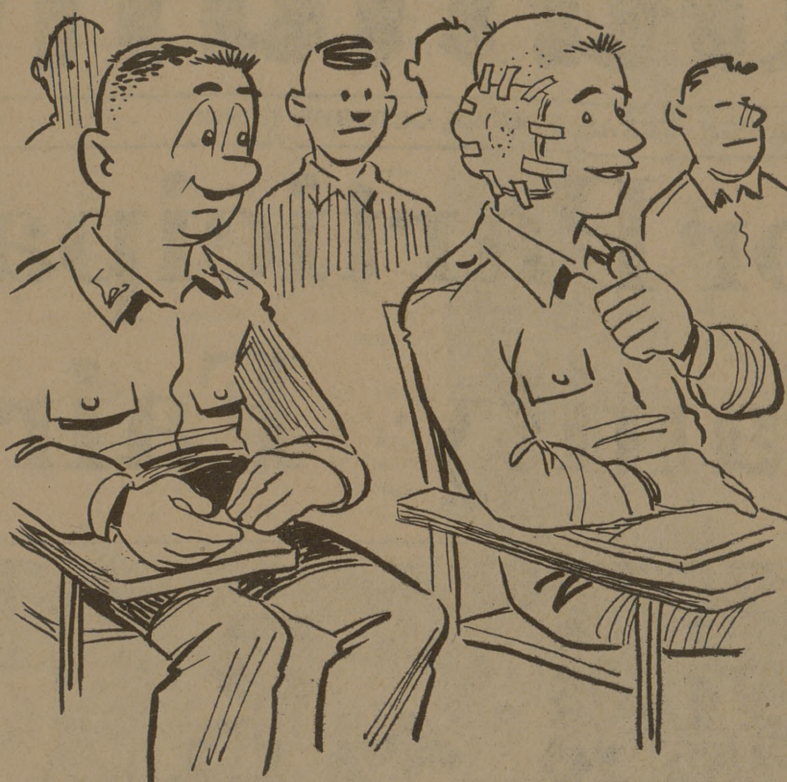
"Naw—My ear's okay! I've got a transistor up here so I can hear th' series!"