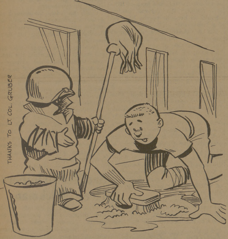
"A&M's neatness and cleanliness sure appealed to me before I enrolled!"