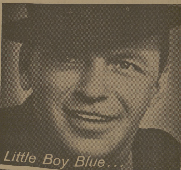
Little Boy Blue...

FEATURES 1:00 - 3:09 - 5:08 - 7:17 - 9:26