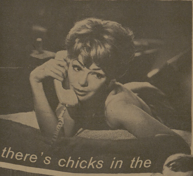
there's chicks in the