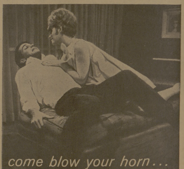
come blow your horn...