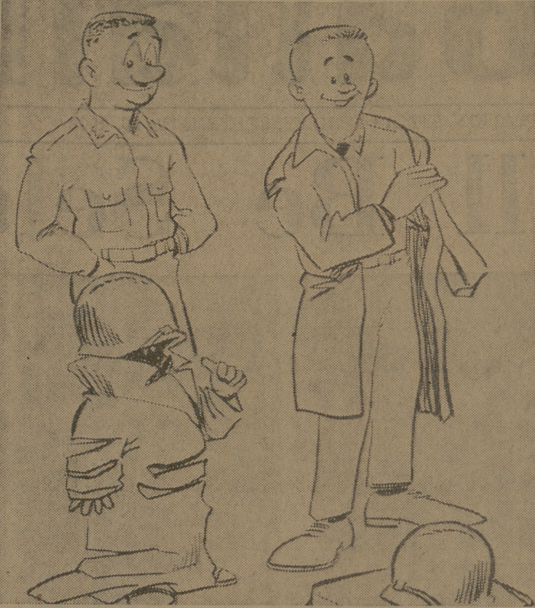
"... Personally, I like to have a uniform I can grow to!"