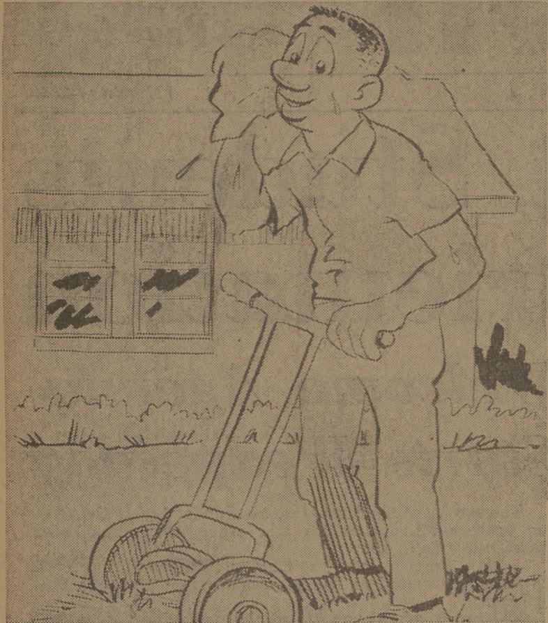
"I never thought I'd see th' time I'd be glad to get back in a cool classroom!"